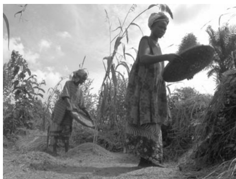
Fig. 30.2. Learning from farmers requires an open, enquiring and positive attitude towards their knowledge and practices.