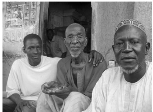
Fig. 30.1. Lasting impressions are passed on from generation to generation through storytelling.

In the 1970s, when the Food and Agriculture Organization of the United Nations (FAO) started to use video as a tool to recover, preserve and reproduce farmers' knowledge, the organization was criticized for using an over-sophisticated medium for a rural setting (Ramírez, 1998). As it turned out, the project paved the way for the use of video as a cost-effective tool to support group training and rural development